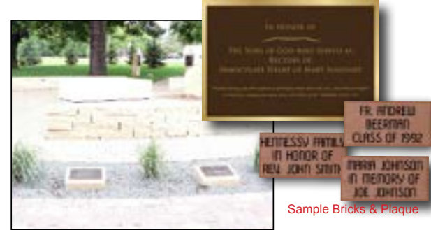
Sample Bricks & Plaque