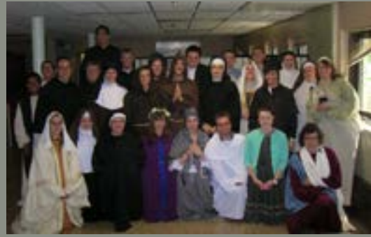
The team wears costumes as part of the Totus Tuus. Teachers take turns dressing up as a saint, while teaching about these